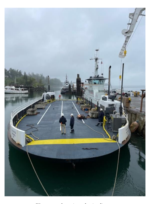
Ferry undergoing the incline test.

The incline test determines the stability of the ship and measures the vessel's center of gravity. The test is conducted by shifting a series of weights across the deck while in the water to measure the resulting incline of the vessel. The incline measurements must meet standard USCG requirements for the vessel to receive an approved stability letter.